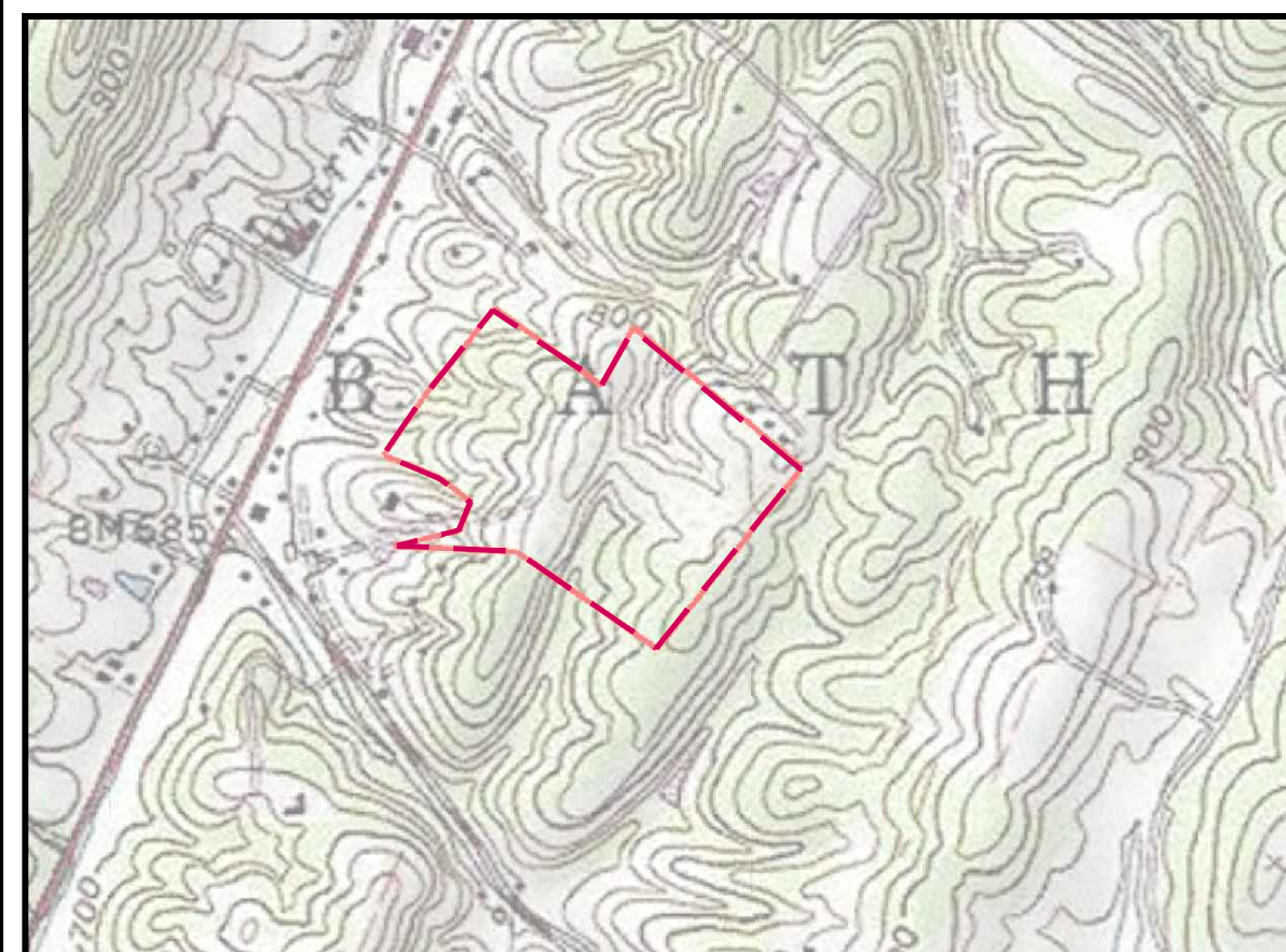
VICINITY MAP: SCALE: 1" = 1000'