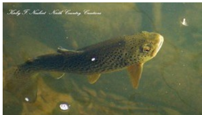
Rising trout by Kirby Neubert at North County Creations